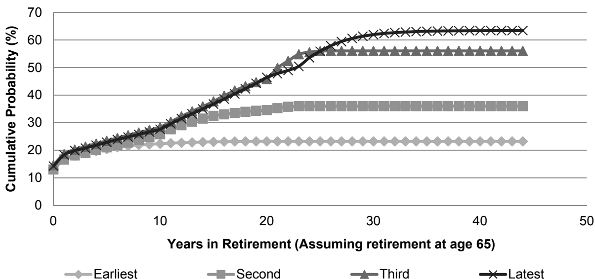
Figure 3.2. Years in Retirement Before Boomers and Gen Xers Run Short of Money, by Relative Longevity Quartile: Simulations with the 2014 version of the EBRI Retirement Security Projection Model®

Note: An individual or family is considered to run short of money in this version of the model if their aggregate resources in retirement are not sufficient to meet aggregate minimum retirement expenditures defined as a combination of deterministic expenses from the Consumer Expenditure Survey (as a function of income) and some health insurance and out-of-pocket health-related expenses, plus stochastic expenses from nursing home and home health care expenses (at least until the point they are picked up by Medicaid). The resources in retirement will consist of Social Security, account balances from defined contribution plans, IRAs and/or cash balance plans, annuities from defined benefit plans (unless the lump-sum distribution scenario is chosen), and (in some cases) net housing equity (in the form of a lump-sum distribution).