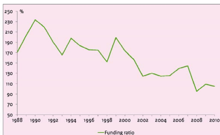
Figure 2 Average nominal funding rate of Dutch pension funds: 1988-2010.